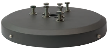
(Cover with Bollard Anchorage)