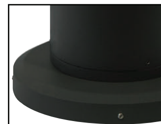
Bollard Retrofit Base (see reverse)

Catalog Number: ECB10QF1X37U*KC♦ (*3K, 4K, 5K; ♦B=Black, Z=Bronze) Available Q4 2020