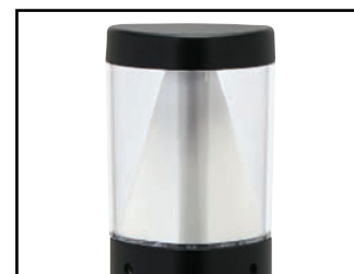
White Low Brightness Cone Reflector

Catalog Number: ECB12QF1X12U*KC♦ (*3K, 4K, 5K; ♦B=Black, Z=Bronze) Available Q2 2021