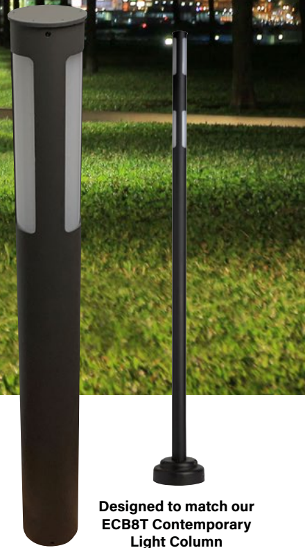
Designed to match our ECB8T Contemporary Light Column

Preliminary, specifications subject to change. Refer to published specification sheet for most current information.