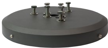
(Cover with Bollard Anchorage)