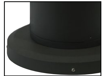
Bollard Retrofit Base (see reverse)