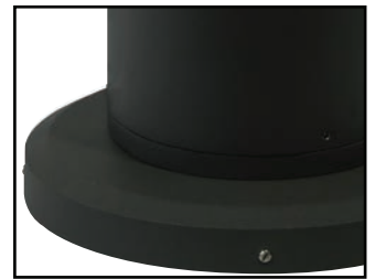
Bollard Retrofit Base (see reverse)