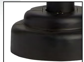
Decorative Clamshell Base Cover