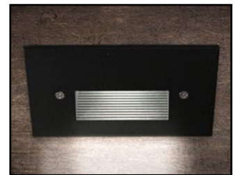
Fully Shield Glare Free Optics

Catalog Number: ECSTP10QF1X41204K* (*B=Black, Z=Bronze, W=White) In Stock Now