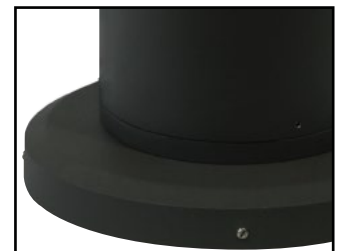
Bollard Retrofit Base (see reverse)

Catalog Number: ECWMB12QF1X28U*KC◇; *3K, 4K, 5K; ◇Color Available Q4 2021 Preliminary, specifications subject to change. Refer to published specification sheet for most current information.